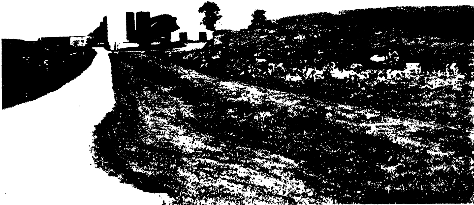
Williamsburg, Blair County