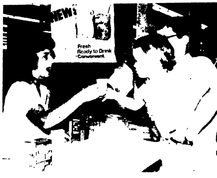
What is that?