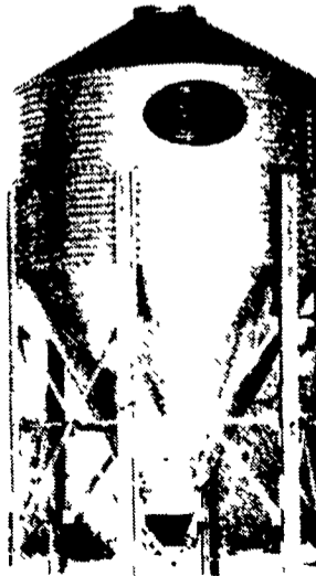
Featuring The New Flex Auger Boot & Straight Auger Boot

NEW From GSI (The #1 Bin Company in the U.S.A.) HEAVY DUTY 2 1/2" CORRUGATED FEED BIN