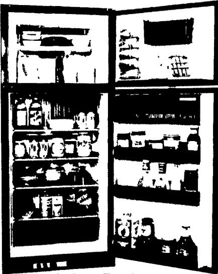
Model 1302 - The One With The Large Freezer

* International model equipped with 220V heating element Does not affect gas operation