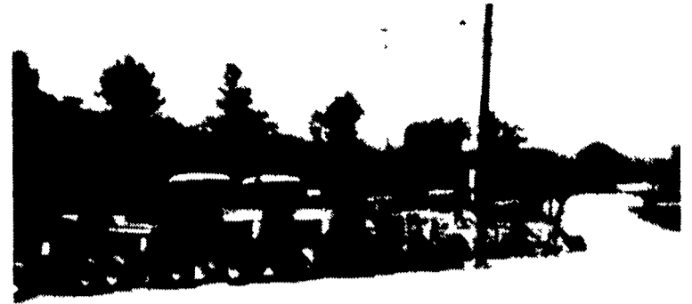
On the other side of Route 443 is the Snyder display lot.