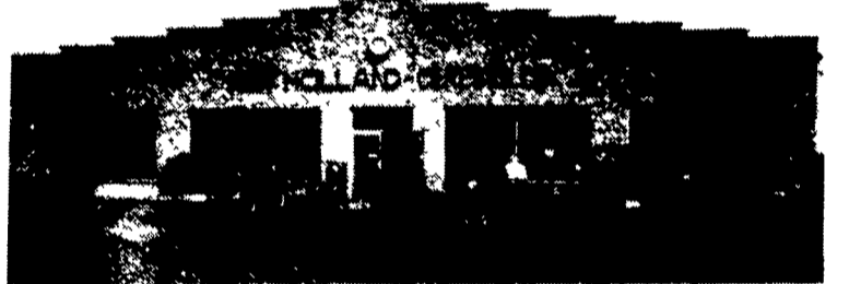
You'll find the largest stock of Ford and New Holland parts in six states in the Frederick, Md. dealership.

Last year, New Holland named them the top producing store in North America. Promotions like Summer Appreciation Prices help keep them on the top of the heap.