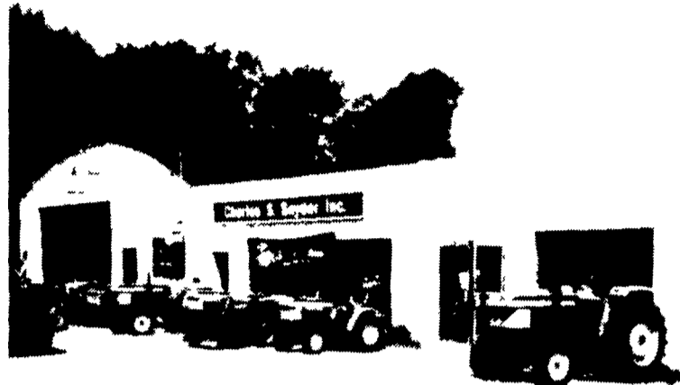
The main building of Charles S. Snyder Inc., Route 3, Tamaqua, Pa.

They sold 50 tractors in 1983 and have received the Distinguished Dealer Award from the Future Farmers of America.