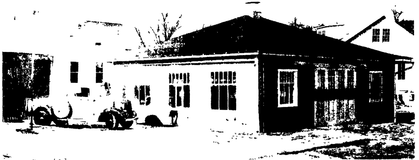
The original Ford dealership in Buffalo Springs, Pa. with a 1936 Ford V-8 pick-up parked outside.