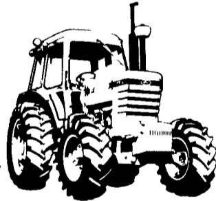
Ford 7710 Front Wheel Drive Tractor