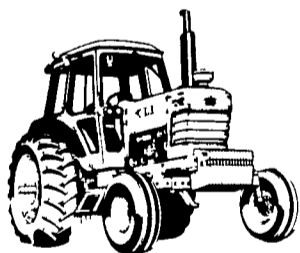
Ford TW 15 Tractor