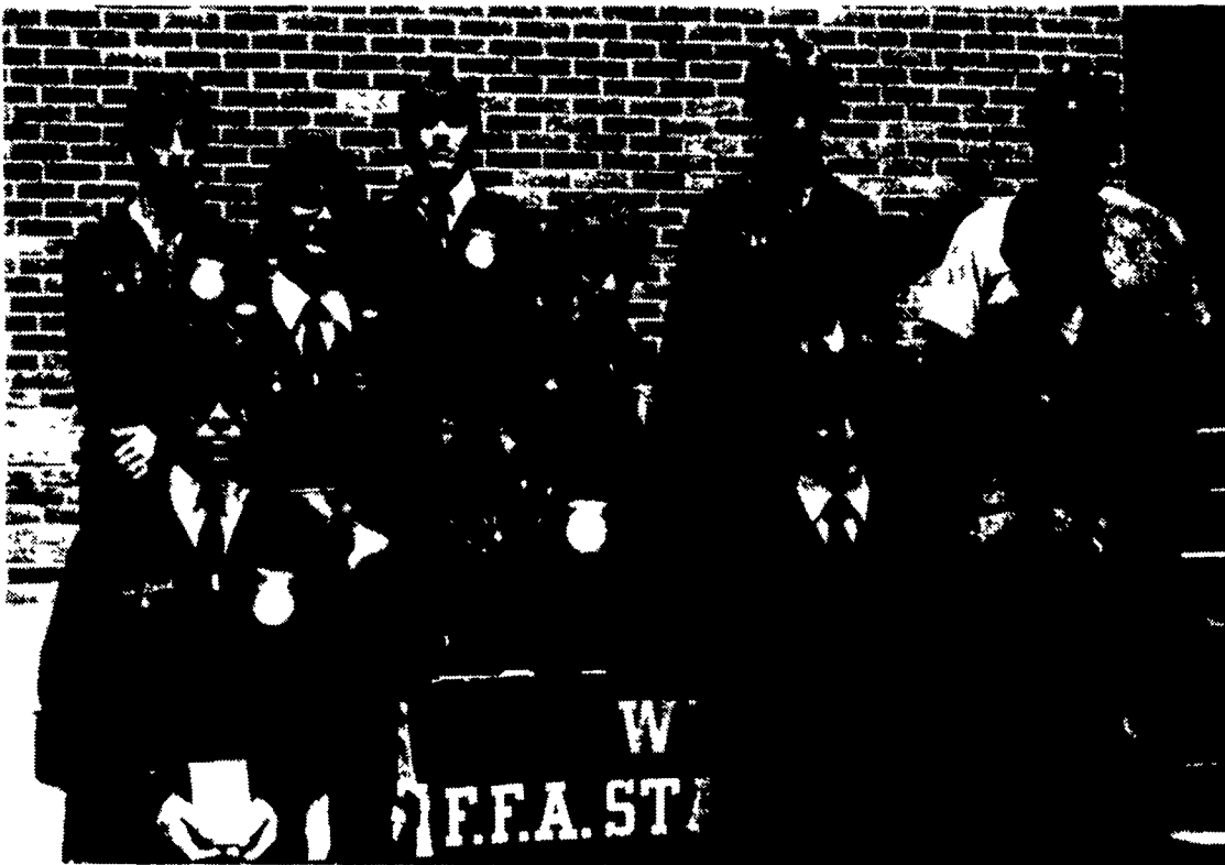
Lancaster County FFA softball champions.