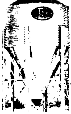
Featuring The New Flex Auger Boot & Straight Auger Boot