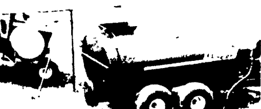
HUSKY FRONT MOUNT SOIL INJECTORS