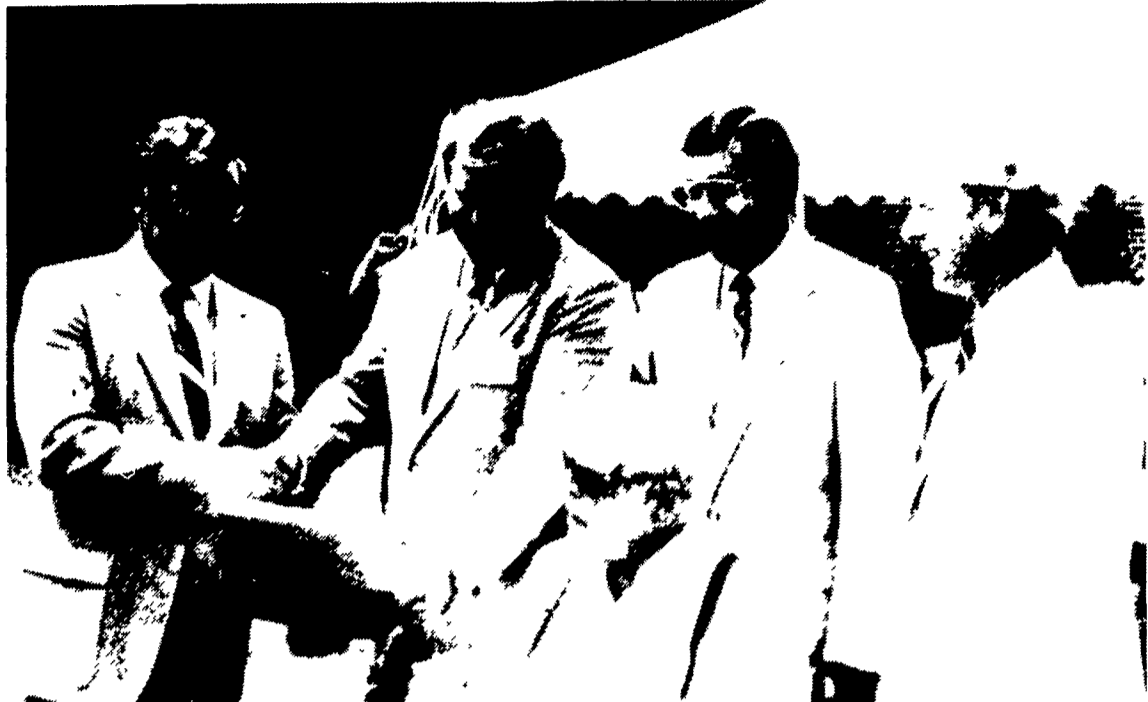
Grand opening ceremonies were held last Saturday at the Appalachian Lamb Co., Greencastle.