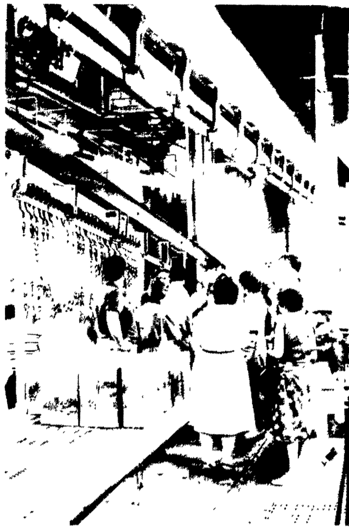
Tours were also conducted of the facilities.