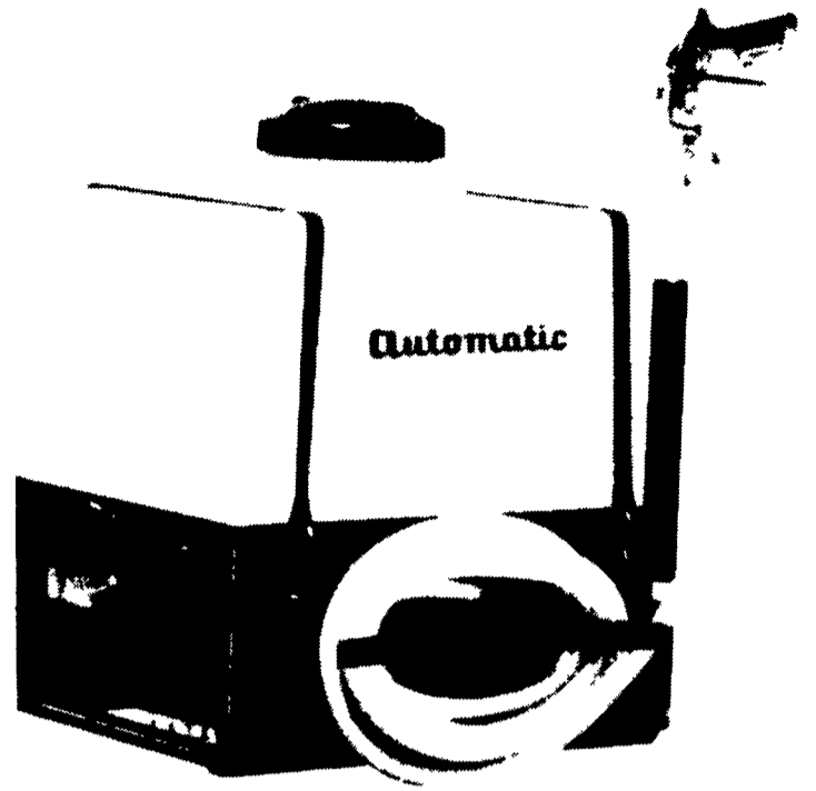
Porta-Mister sprayer mounts on any vehicle.

For further details contact the manufacturer, Automatic Equipment Mfg. Co., Department NR, Pender, Nebraska 68047, 402-385-3054, or the distributor, Ryder Supply, Box 219, Chambersburg, Pennsylvania, 17201, 717-263-9111.