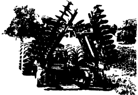
Krause 1900 Disc

We Have A Limited Supply At These "Rock-Bottom" Prices. Call Today. Don't Delay.