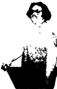
R. Smith Myerstown, PA

You Lose 10-29 Lbs. Excess Weight In The First 30 Days With The Herbal weight loss program for less than $30.00 or your money back