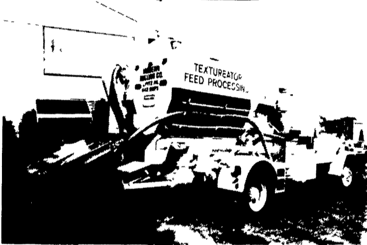
In addition to manufacturing both mobile and stationary mills, Sam High provides on-farm milling service with this unit operating as Modern Milling Company.