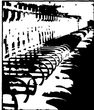
Feeders attach to tube as needed adjust for feed quantity.