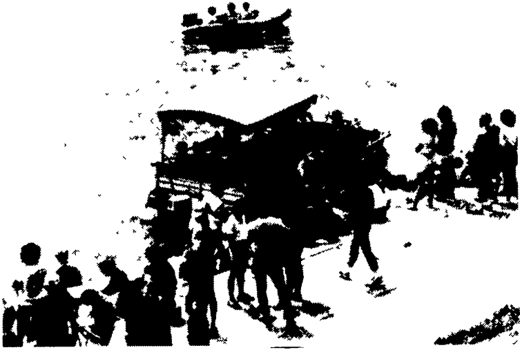
Pontoon boat rides are offered as part of the Susquehanna River Celebration.