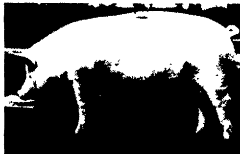
Pennsylvania's Record Selling State Sale Bred Gilt

12 York Gilts Carrying Service To Top Indexing Boar Ohio Test Station. Crossbred Gilts Bred For 3 Way Cross.