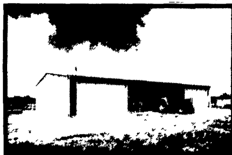
AG MASTER 2:12