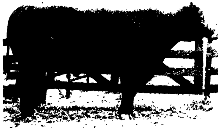
Pride of Fairview Farm is Krueger's Foolish Pride, born on April Fools Day, 1981.