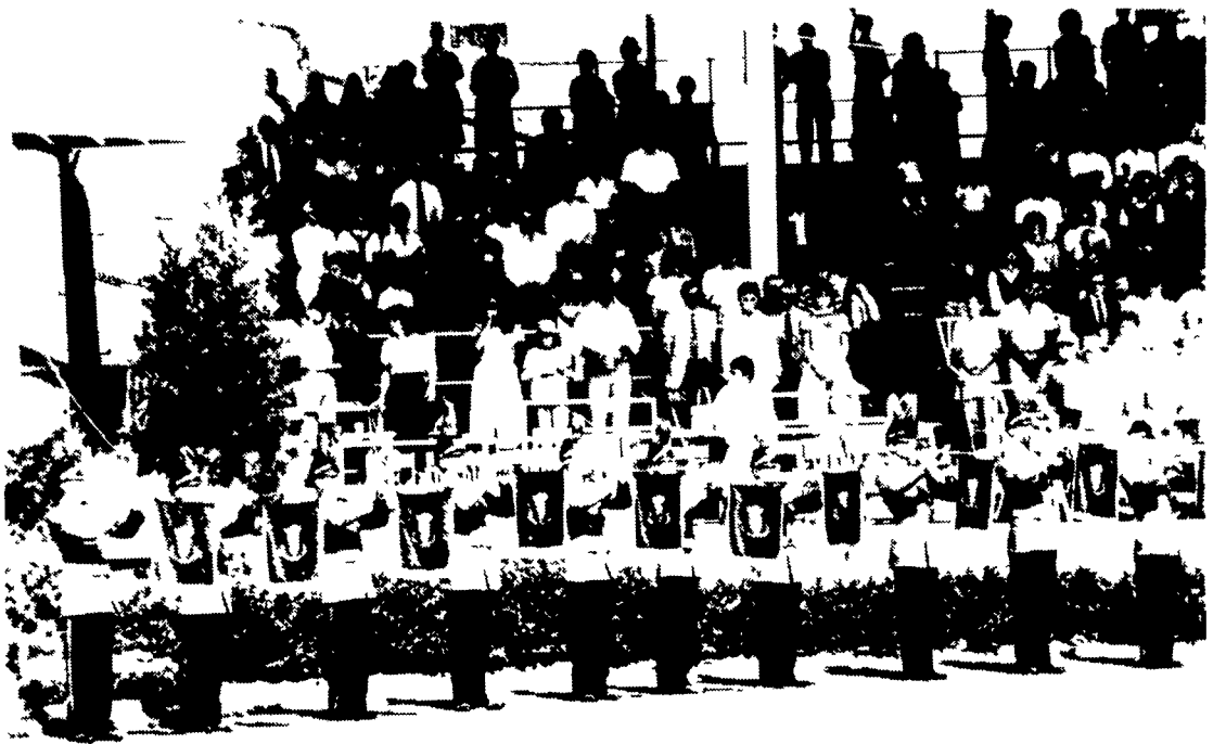
Cadets from the Valley Forge Military Academy and Junior College are scheduled to perform again at the Devon Horse Show.

United Farm Tools No-Till Grain Planter drill For Soybean and Other Grains