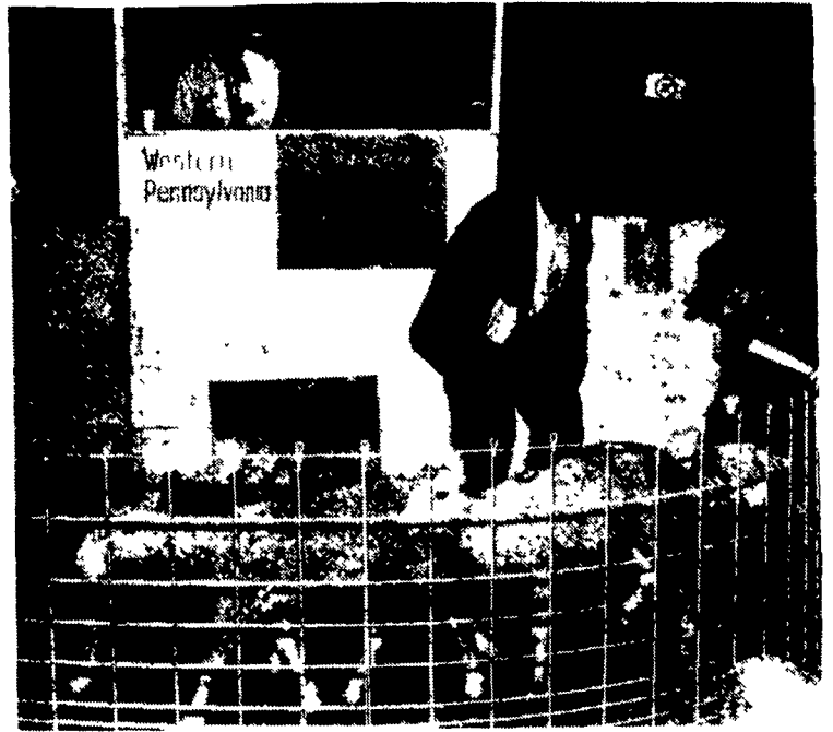
A pen of Dorset-cross ewe lambs are offered for sale at Mercer 4-H Park. Prices at this year's Western Pa. Sheep and Club Lamb Sale averaged $13 per head higher than last year.