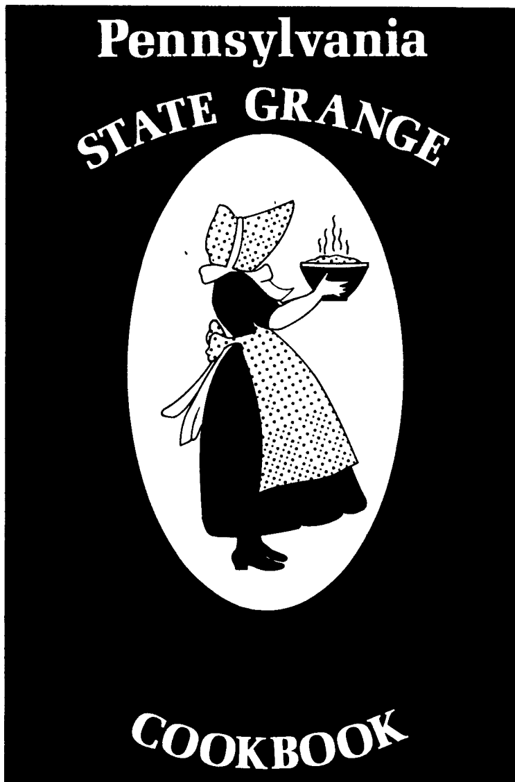
The Pennsylvania Grange's fourth cookbook is scheduled for publication early in June. A unique feature of the cookbook is that it will be offered on computer tape.