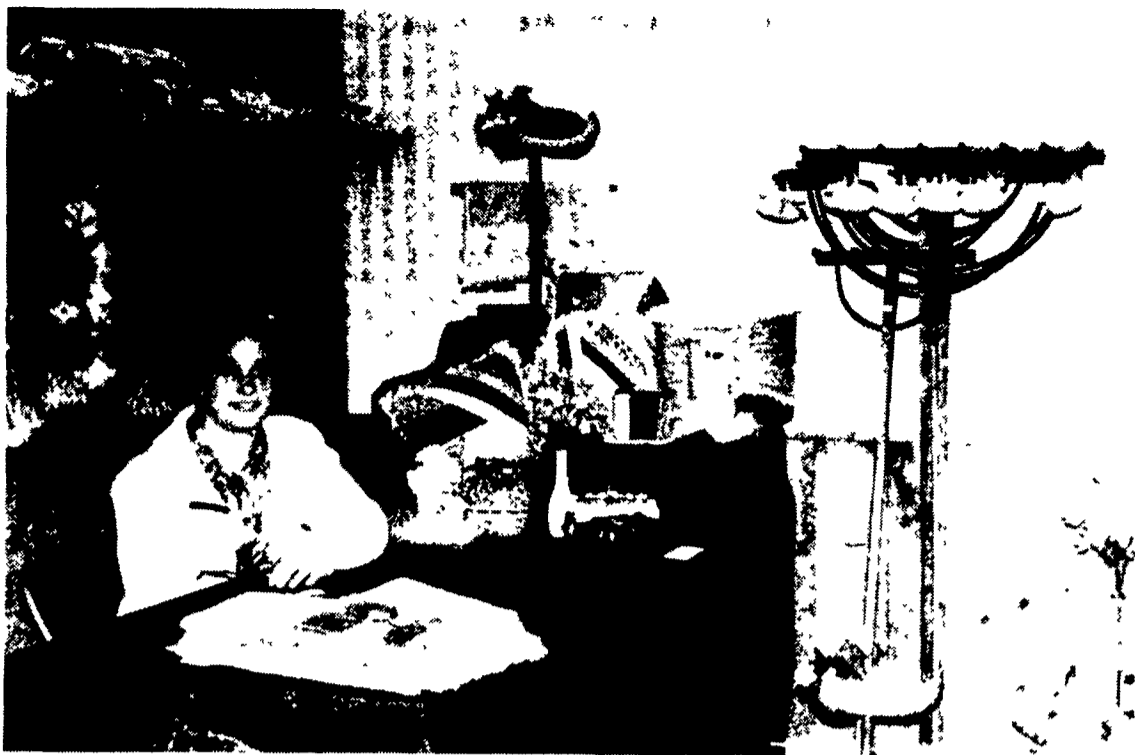
Audrey has spent many hours remodeling a small summer house to open a store in which to market her custom-made country decorating accents.

Actually, Audrey says she never dreamed her first ventures into selling crafts would reach this size. She found herself maintaining a larger inventory to meet the demand, and now it has become a full-time venture.