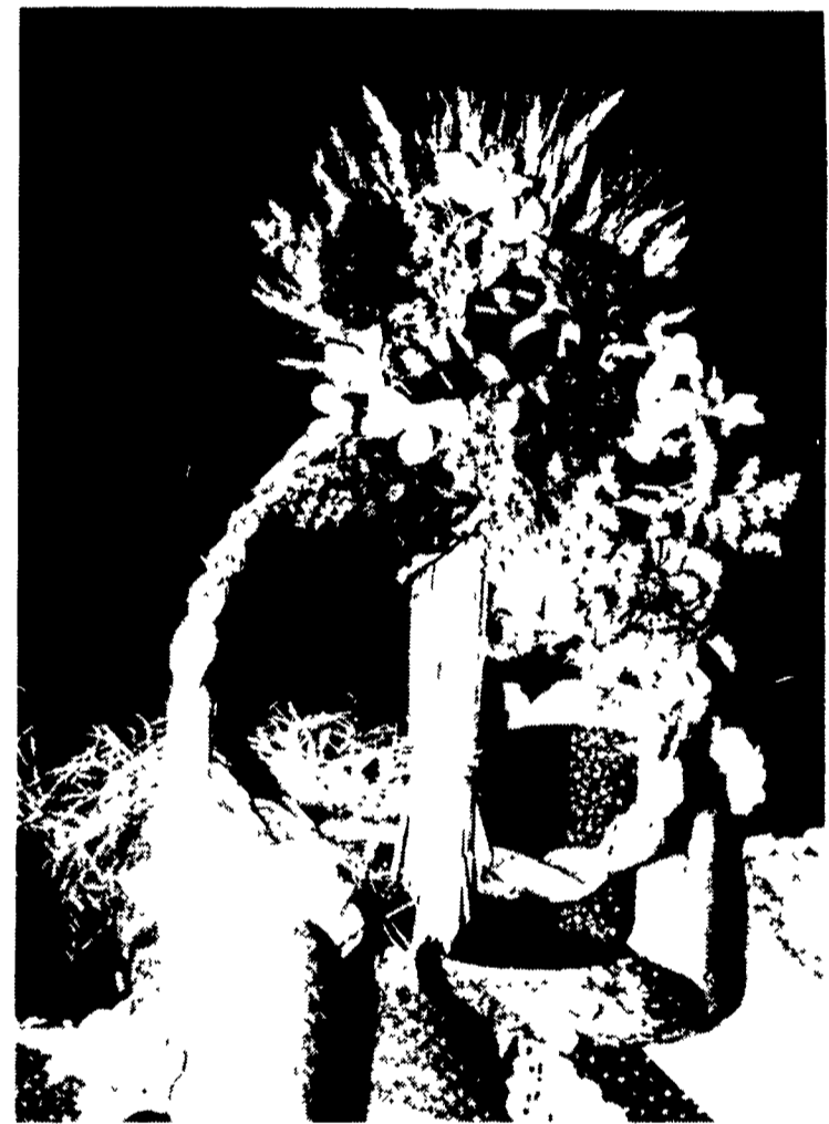
Woven wheat hearts are made of wheat grown by Audrey specifically for this purpose.

Ken and Audrey Mull invite you to stop by and visit "Audrey's Country Crafts" which is located 2½ miles off Interstate 78 or one mile north of Mt. Zion along Union