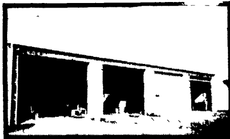
SHOP - STORAGE - GARAGE