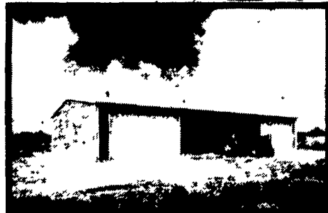
AG MASTER® 2:12