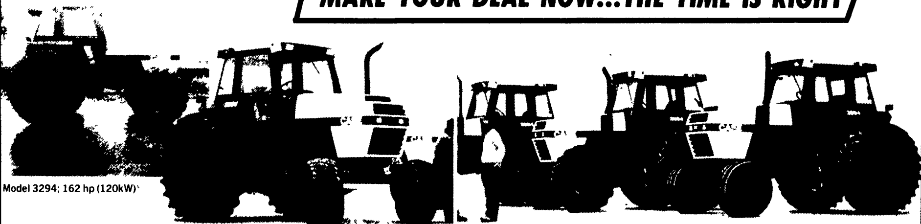
Model 3294, 162 hp (120kW)*