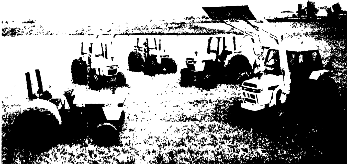
Model 1194, 43 hp (32kW)* Model 1294, 55 hp (41kW)* Model 1394, 65 hp (48kW)* Model 1494, 75 hp (55kW)* Model 1594, 85 hp (63kW)*

Whatever your power requirements see your Case dealer for value attractive financing confidence and productive tractors that are a pleasure to own and operate Ask him about TOPS the Tailored Owner Protection System available to purchasers of new Case 94 series tractors