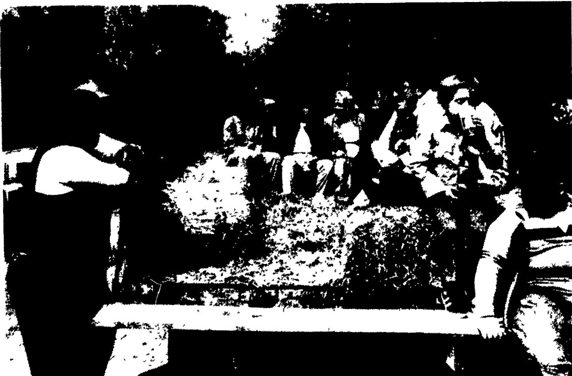
Some festival-goers preferred old-fashioned hayride through orchards, while others toured through blossoming trees in buses.