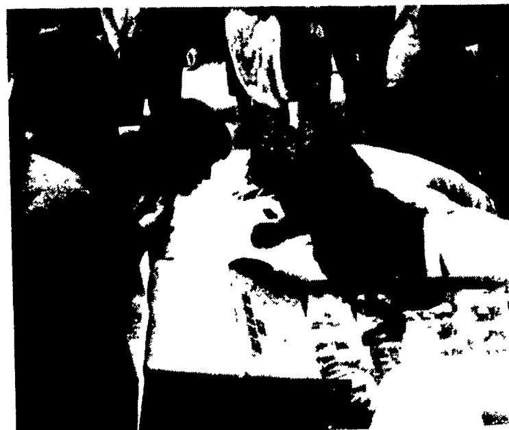
No festival is complete without apple pie eating contests. Both youngsters and adults competed in Adams County.