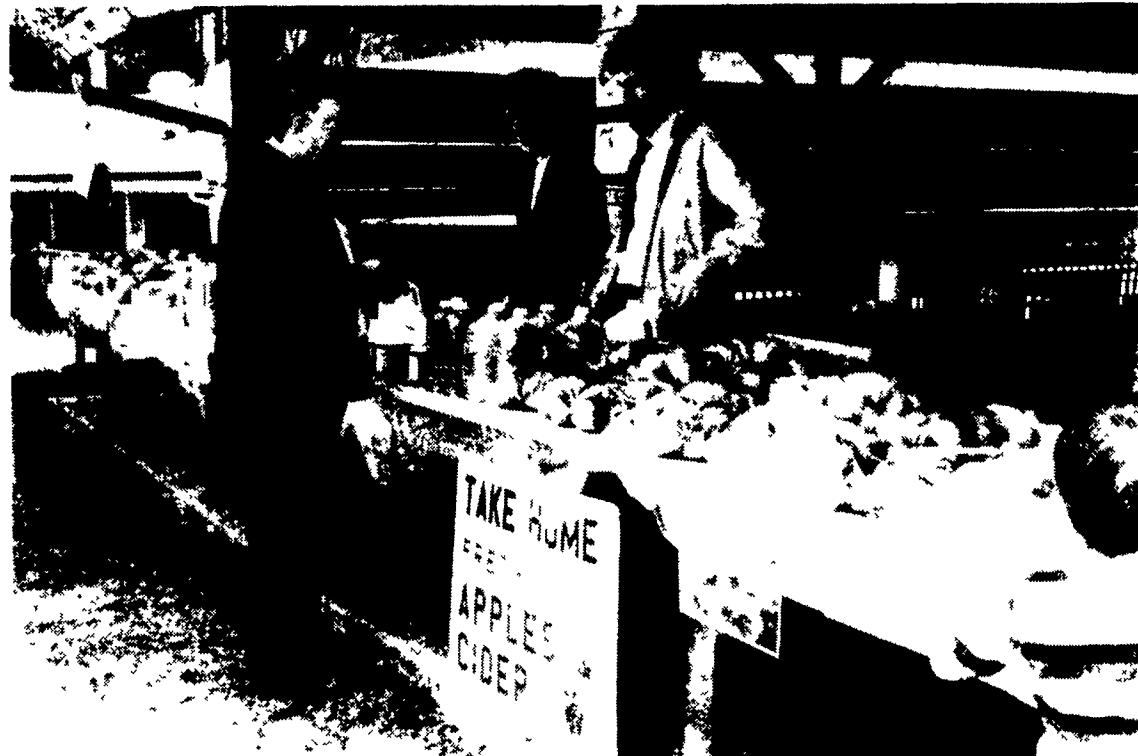
Sales of apples, cider and apple butter were brisk last Saturday and even on Sunday despite wet weather at Apple Blossom Festival.