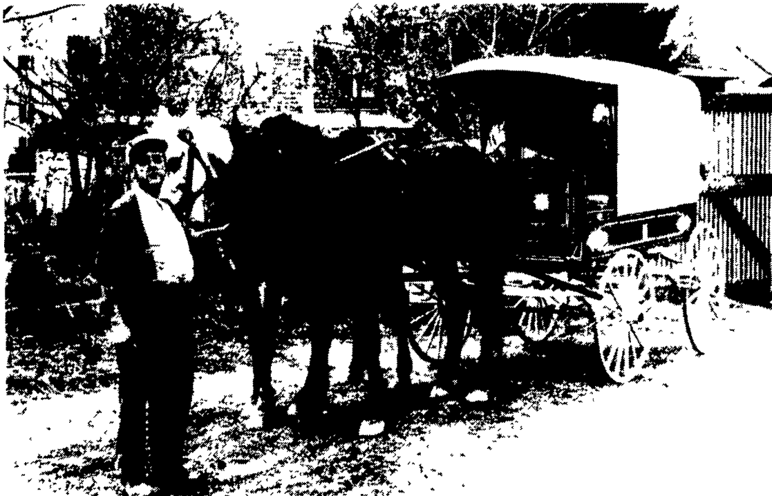
Mervin Moyer, Leesport, is shown with rebuilt Schwab delivery wagon he'll be displaying in Centerport Centennial parade in Berks County next Saturday. Wagon dates back to the later 1890's and comes out of Lebanon County.

antique cars, motorcycles, horse drawn vehicles, and Reber, Gruber, and Schwab wagons for everyone to browse around.