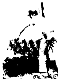
Easy to use, handle, store

TILLAGE — Use back of field cultivator (photo) spring tooth plow or alone. prepares a fine seedbed. 1 up crust on hard packed soil. Use for first cultivat corn, beans, etc. Covers small grain back of broadcaster.