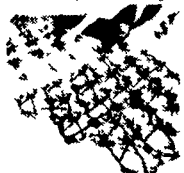
Connecting front and rear sections of Hercules Harrow