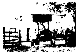
Easy way to transport Hercules Model 12