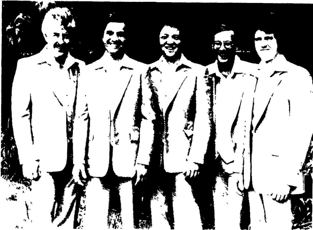
The Bluegrass Cardinals, a group from Virginia, will perform at the Guernsey Barn on May 12.