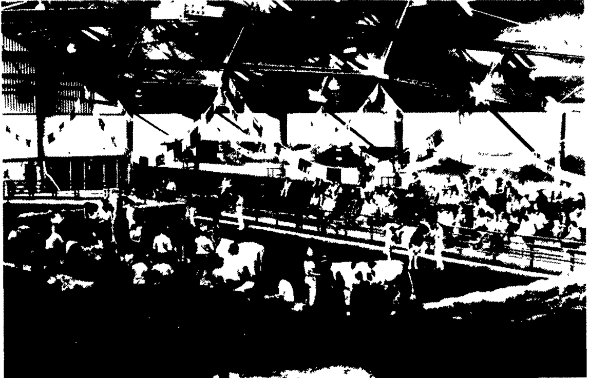
Although construction work is uncomplete, the Penn State Ag Arena was host to both the Dairy Exposition held last weekend and the Little International Livestock Exposition held April 21.