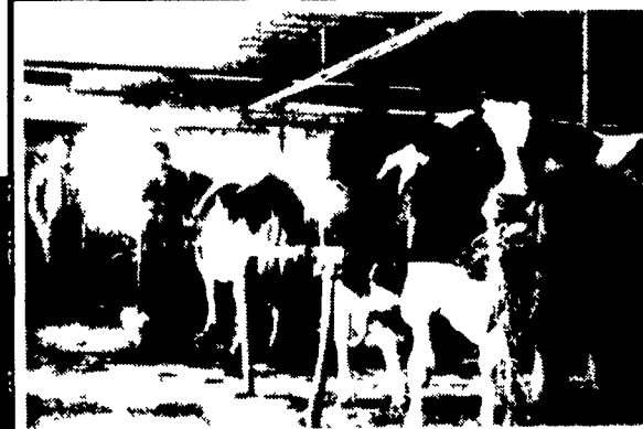
Neffdale Elevation Poly Projected at over 22,000 of milk this year

HESS MILLS PHONE 717 442 4183 PARADISE PA 17562