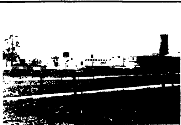
Neff's Picture Perfect Farm in Lancaster Co.