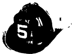
One of the firemen's helmets (some made of leather)