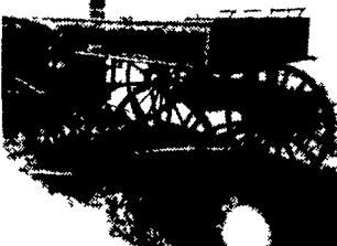
Hand drawn hose wagon made by A.F. & S.C. Stewart, Rochester, N.Y., circa 1885

MINIATURE CIRCUS duplicated from the Barnum & Bailey Circus, handmade 20 to 40 years ago, approx. 4000 pieces including animals, tents, 40 h.d. circus wagons. Photos available after April 30th, upon request