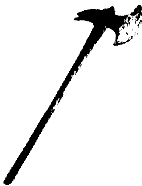
Parade fire ax, Viking style, circa 1880