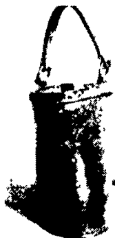
One of several leather water buckets