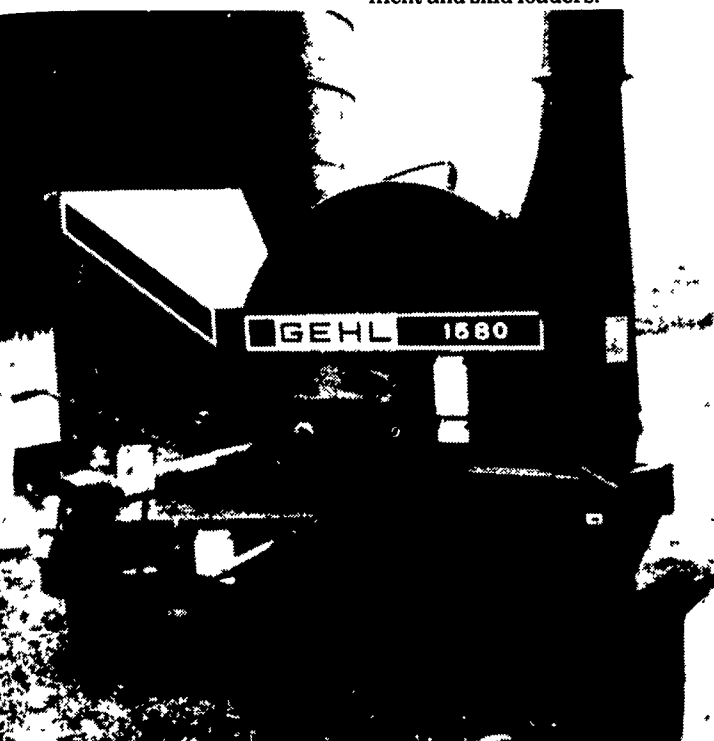
The Model 1580 is one of two new forage blowers introduced by Gehl Company.