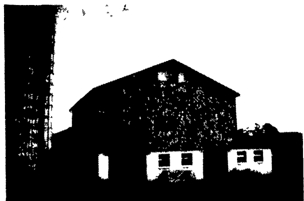
40' SPAN UNI-FRAME ARCH EXTERIOR PICTURE Lancaster County