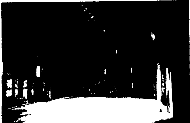
44'x80'x14' Lebanon County We can match existing stone wall.