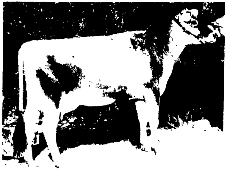
W.F. Chocolate Bits has a sister in the upcoming Waverly sale. Their dam is an Ex.-92% Quicksilver with over 22,000 lbs. of milk and 1000 fat. A daughter of "Bits" will also be featured in sale.