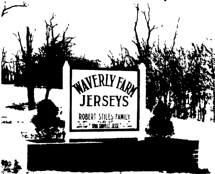
Sign at lane leading to Waverly Farm identifies it as the home of Sybil Surville Jesse.