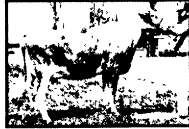
Her Daughter Will Sell

The Greystone herd, one of the oldest in the country, is now at its peak A milking herd dispersal was held two years ago A young herd has developed from the heifers and offspring of the older cows that were retained