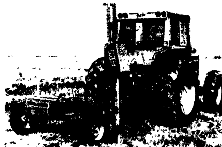
The new Massey-Ferguson 390 Post Driver features a self-contained hydraulic system with pto-mounted pump.

A built-in post carrier, standard equipment on the MF 390, can carry a generous supply of posts to save transportation time.