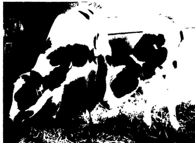
These are first identical twin bull calves born in joint ABS/University of Wisconsin research project.

Wisconsin project is funded by W.R. Grace & Company, ABS' parent company, and is designed to develop genetic improvement, embryo transfer and the production of identical twins through a variety of techniques.