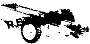
206 Ground Drive Spreaders in Stock