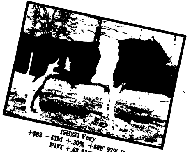
15H231 Very +$83 -43M +.30% +50F 97% R PDT +.63 93% R

These well-proven Atlantic sires, above average for calving ease, used in conjunction with good heifer management are your key to a successful heifer AI program!