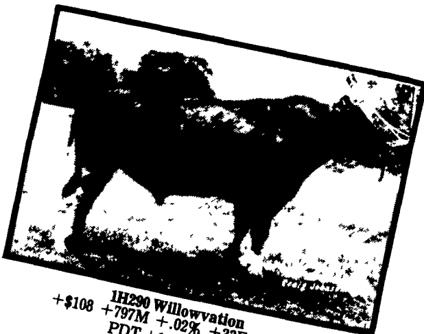
1H290 Willowvation +$108 +797M +.02% +33F 77% R PDT +1.69 73% R