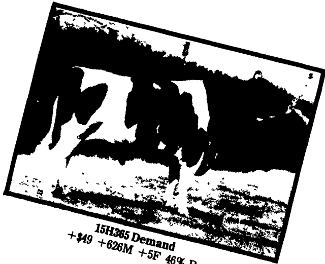
15H385 Demand +$49 +626M +5F 46% R

These well-proven Atlantic sires, above average for calving ease, used in conjunction with good heifer management are your key to a successful heifer AI program!