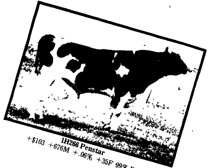
1H266 Penstar +$103 +676M +.06% +35F 99% R