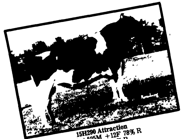
15H290 Attraction +$54 +525M +12F 78% R PDT +.48 73% R

Don't sacrifice quality genetics in your herd, contact your Atlantic Technician or Direct-Herd Representative for these and more well-proven sires high on the NAAB calving ease list.