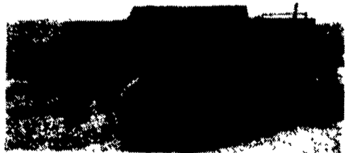
Smaller Improved Model

ALLIS CHALMERS AND WISCONSIN POWER UNITS COMPACT ROTO BEATERS