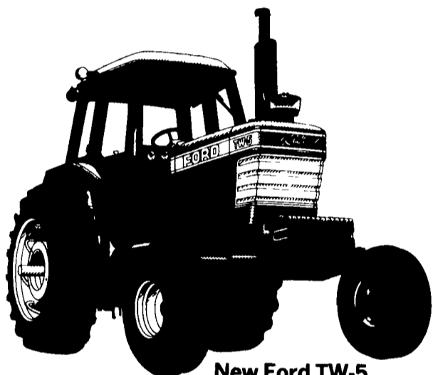
New Ford TW-5

Example of a lease-purchase transaction, not necessarily for a particular Ford tractor or for your transaction