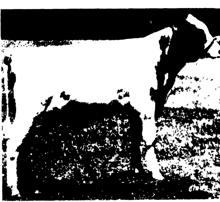
Left-Mac Mainstay-Red is son of Coldsprings Elevation

For information on Mainstay or Red & White Associates, you may write Mead Dr., Boulder, Col. 80301.