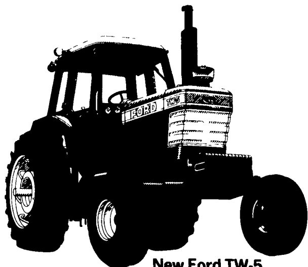
New Ford TW-5

Example of a lease-purchase transaction, not necessarily for a particular Ford tractor or for your transaction