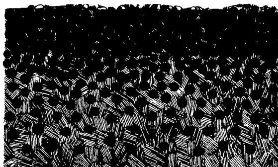
Bicep stays active in the germinating zone of weeds and grasses

But with Bicep, adsorption is excellent, which helps explain why Bicep has staying power. Bicep stays active in