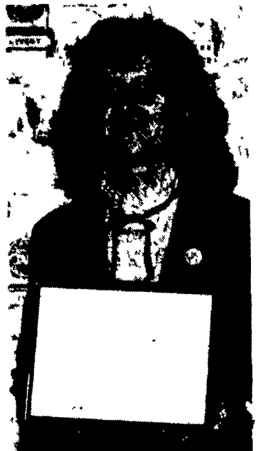
Betty Lou Kauffman Service Award

planting, adding that other conservation practices are also beneficial.