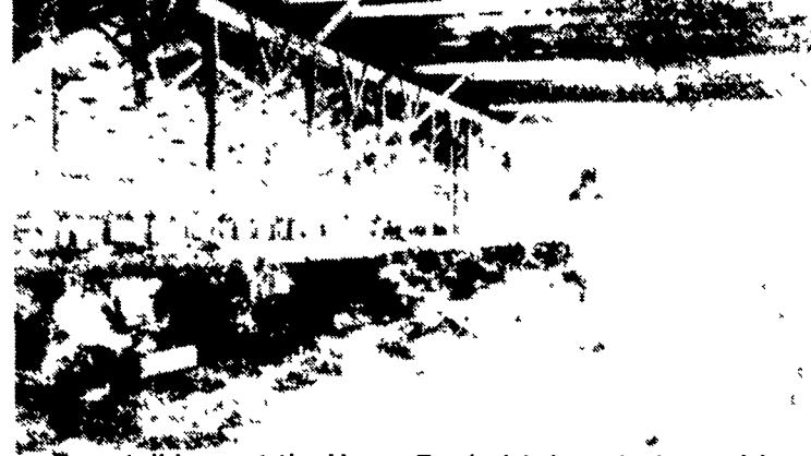
Freestall barn at the Vance Frederick farm features drive-through feed lanes and plenty of space.

The final stop was at the farm of Vance Frederick and his family. Family owned and operated, Frederick Farm features over 300 Jerseys milking and over 500 acres farmed. An impressive, drive-through feeding barn with freestalls houses the 300 milking animals. Breeding philosophy is different at Frederick Farm and island bulls and bloodlines are utilized to keep with true Jersey type and high Jersey test. The Fredericks held a reduction sale last year and are planning a repeat sale in 1985 to let people realize how well island breeding can do in other herds. They are also planning on donating a calf each year to the Jersey Youth program as an