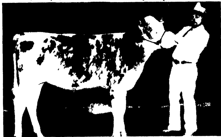
Junior champion Red and White female is Med-O-Bloom Grandeur's Jewel, exhibited by Downedale Farms, St. Mary's, Ontario.

Approximately 35 exhibitors (Turn to Page A26)