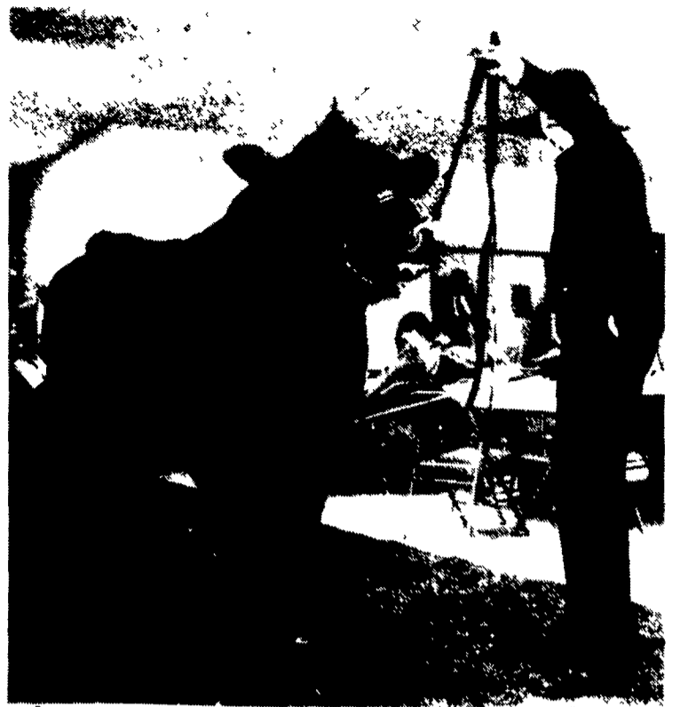
Angus representative at the Adams County Beef Ball and Parade of Bulls, was TJH Powerplay, owned by Hoffman Angus Farm of Dover.