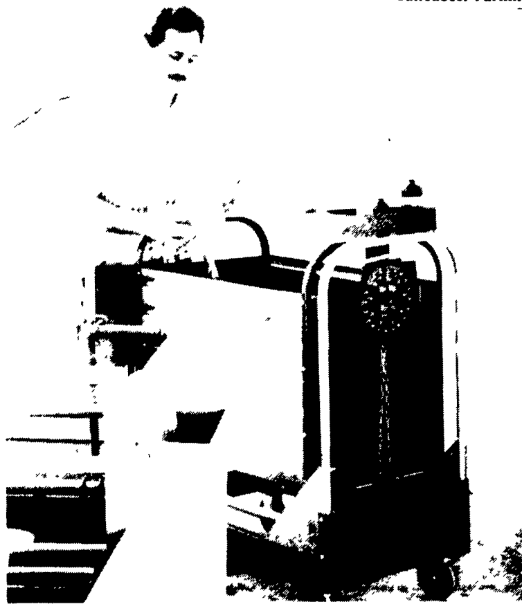
WayPig litter scale weighs and transports pig litters.