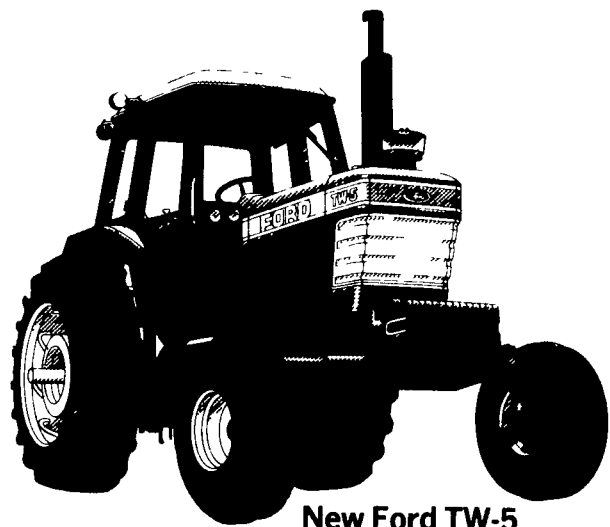
New Ford TW-5

Example of a lease-purchase transaction, not necessarily for a particular Ford tractor or for your transaction