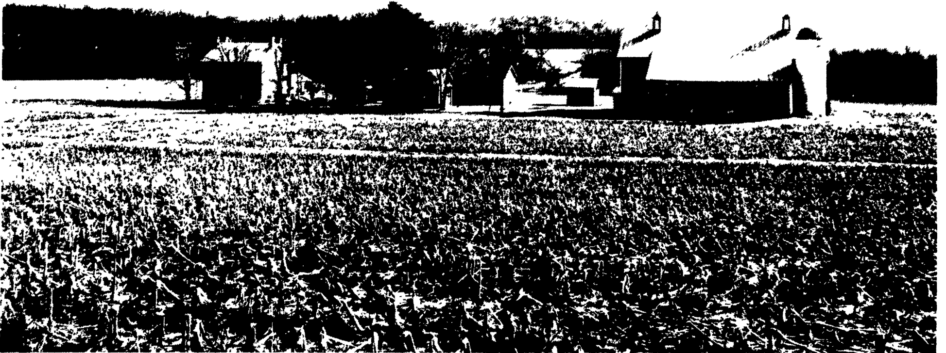
Milton, Northumberland County