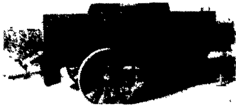
Smaller Improved Model

ALLIS CHALMERS AND WISCONSIN POWER UNITS COMPACT ROTO BEATERS